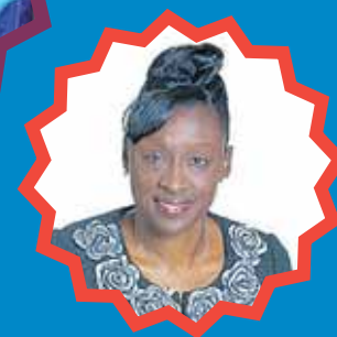
Deputy Mayor Anntoinette Bramble